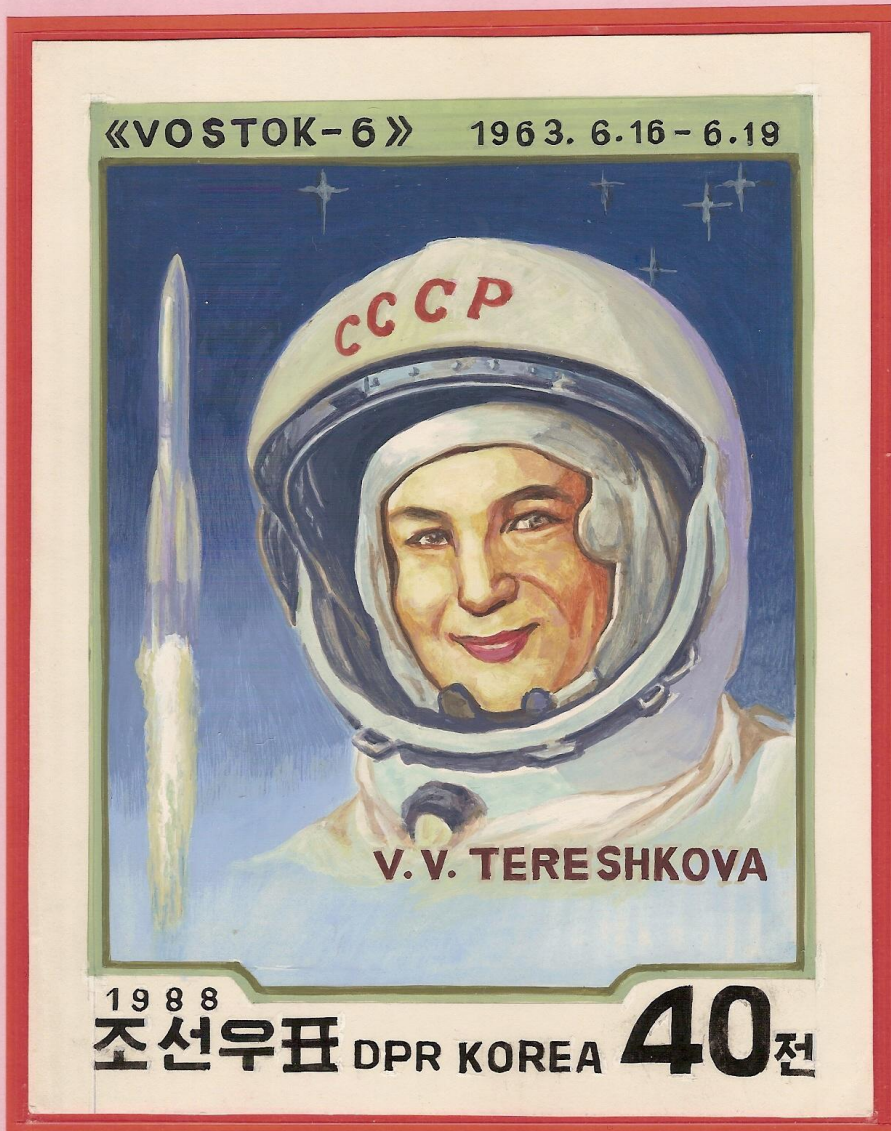
Valentina Tereshkova - unaccepted drawing, watercolour on carton, North Korea 1988