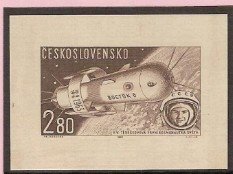
trial print, Czechoslovakia 1963