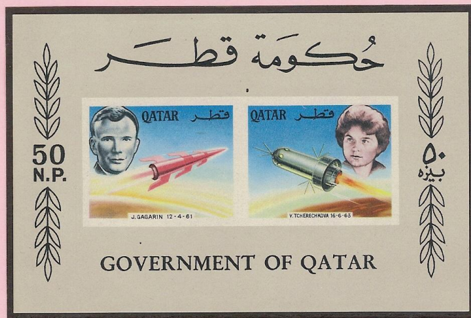
Gagarin and Tereshkova, unissued imperforate sheet Qatar, 1966